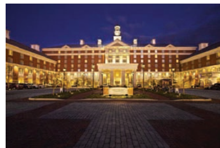
Hilton Columbus at Easton

OFDA offers a full three-day registration or single-day registration. The full registration fee includes speakers, exhibits, breaks, lunch, welcome and president's receptions and breakfast. A $600 VALUE! Please type or print the requested information clearly.