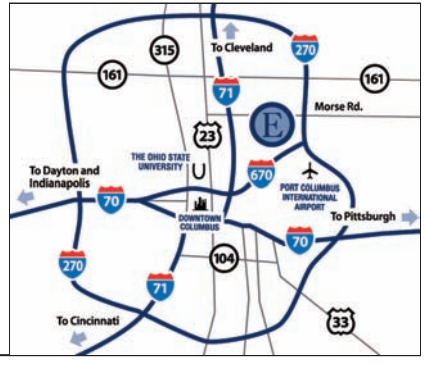
I-270, Easton Exit 33