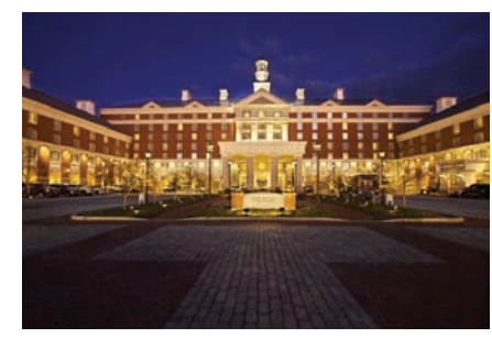
Hilton Columbus at Easton

Please take a moment and look over the registration form found on pages 13 & 14. New this year, OFDA is offering a full three-day registration or single-day registration. The full registration fee includes speakers, exhibits, breaks, lunch, the welcome, wine and cheese, and president's reception, and breakfast. A $600 VALUE! Please type or print the requested information clearly.